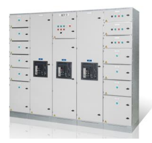
Distribution & Control Equipment