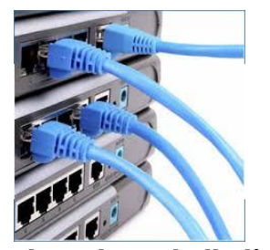
Network Installation & Support Services