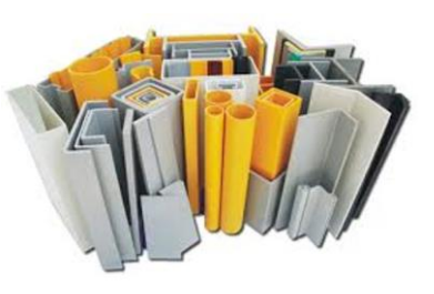
Heat Exchangers & Accessories