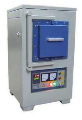
Electric Heaters & Accessories