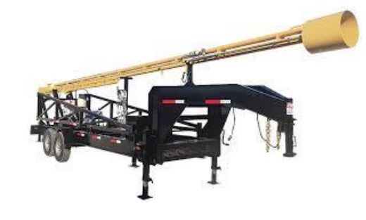
Stacks, Flares and Accessories