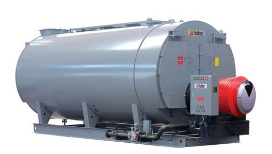
Steam Boilers & Accessories