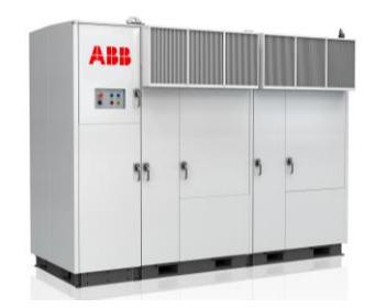
Rectifiers, Inverters & Converters