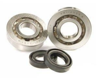
Metal bearings & Seals