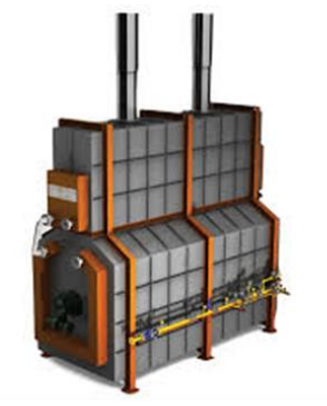
Direct Fired Heaters & Accessories

We are licensed to provide the following products by the Department of Petroleum resources and under our NIPEX registration.